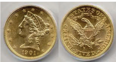
This is a 1901-S Half Eagle