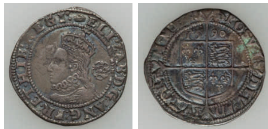
Elizabeth sixpence and penny.