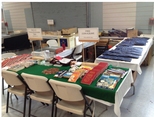
The Junior table before the show