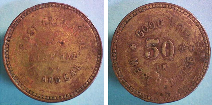
Post Exchange, Alcatraz