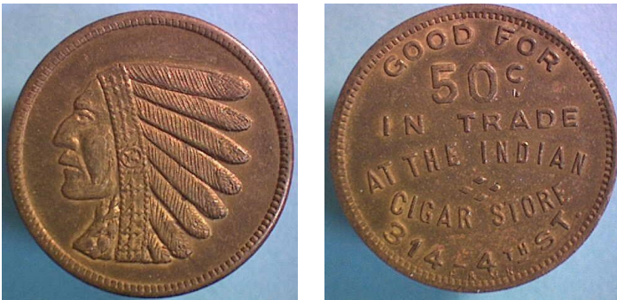
Indian Cigar Store, Santa Rosa