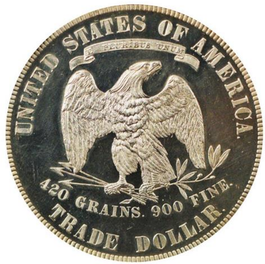
Thanks to Guy S for the special treat!