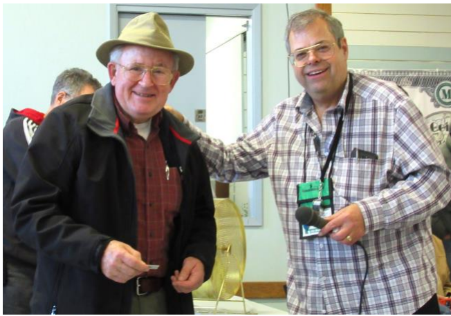
Two of the 2-1/2 peso gold winners.