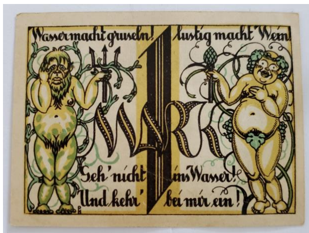
"Water makes you shudder, making wine is fun, don't go in the water, and return to me with one"