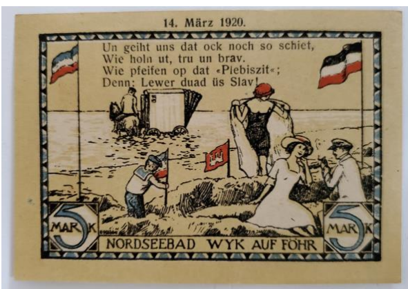
This is a different dialect that I could not find a translation for