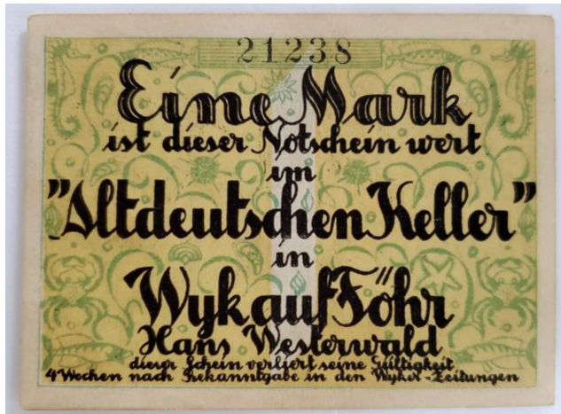
"This Notgeld is worth One Mark at "Old German Cellar" in Wyk auf Föhr"