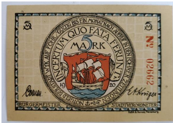
"Notgeld of the town of Wyk auf Föhr/valid for a month for requesting the Föhr newspaper/5 Mark"