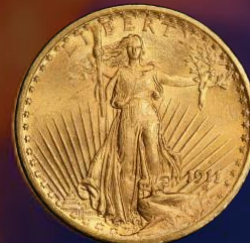
1911-S $20 St. Gaudens Double Eagle PCGS/CACMS65+ $13,000

2490 W. 3 rd St., Santa Rosa, CA 95401 2299 Lombard St., San Francisco, CA 94123 Wittercoin.com sales@wittercoin.com