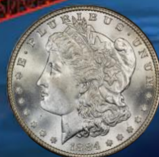
1884 $1 Morgan Dollar CACG MS67 $6,800

We buy collections large and small. Call the team today! 707-544-1621