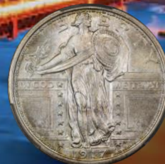
1917 25¢ Standing Liberty Quarter Type I CACG/CAC MS66FH $2,950