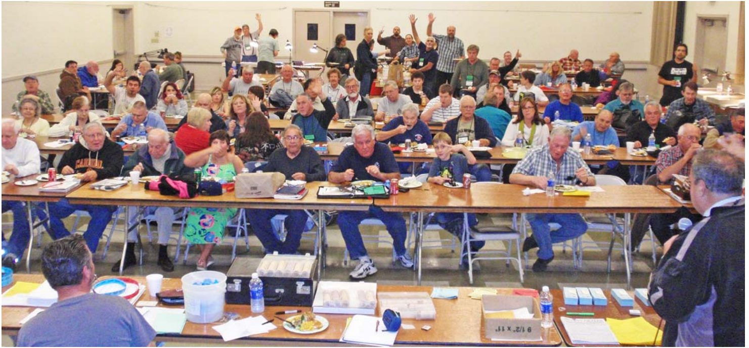
The quietest time you ever find at the meetings is right after everyone has been served and is seated. A few hungry souls were able to look up from their plates and wave for this photo.