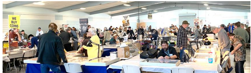
Scenes from early Friday before it got crowded.